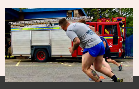
Bleep tests your cardio endurance. You need to achieve Level 8.8 to pass

Don't worry if you haven't done these kinds of exercises before. You will be given personal development plans by our fitness advisors, and you will be given clear guidance and instruction on how to use the equipment involved, as well as a demonstration of each individual test. You may be required to wear firefighter Personal Protective Equipment and undertake the following tasks: