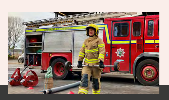
Equipment carry tests your cardiovascular fitness, muscular strength and endurance by carrying and running with a hose