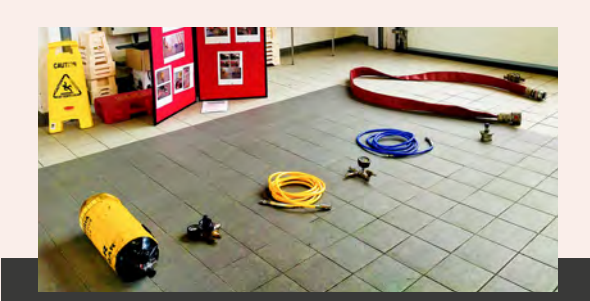
Equipment assembly tests your manual dexterity and ability to follow instructions to assemble and dissemble a piece of equipment