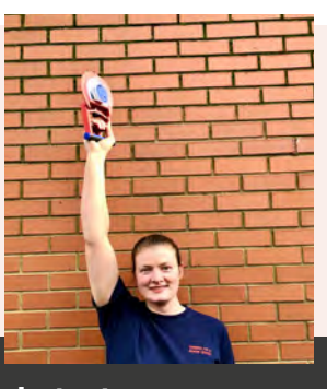
Hand grip tests measure your hand grip strength and your ability to carry equipment