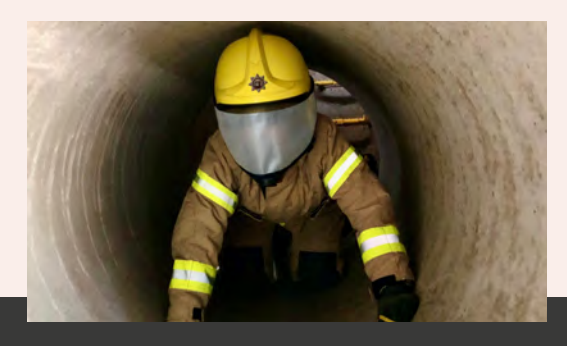
Enclosed space entry tests your agility and confidence working in this environment.