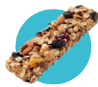
Non- perishable snacks