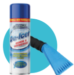
De-icer and ice scraper