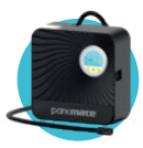
Tyre pressure gauge and pump