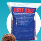
Small bag of grit or cat litter