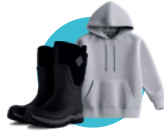
Spare warm clothes and sturdy boots